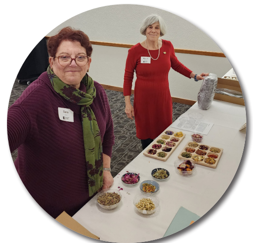
From the February 1 Sisterhood Tu B'Shevat Seder.