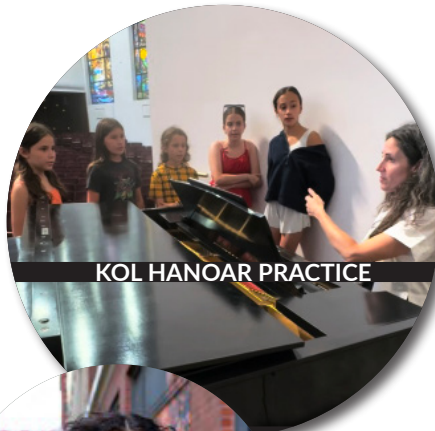
KOL HANOAR PRACTICE

Renew your spirit and prepare for the High Holy Days through song with our Cantors. Bring your voices and join us outside as we open our hearts during the month of Elul.