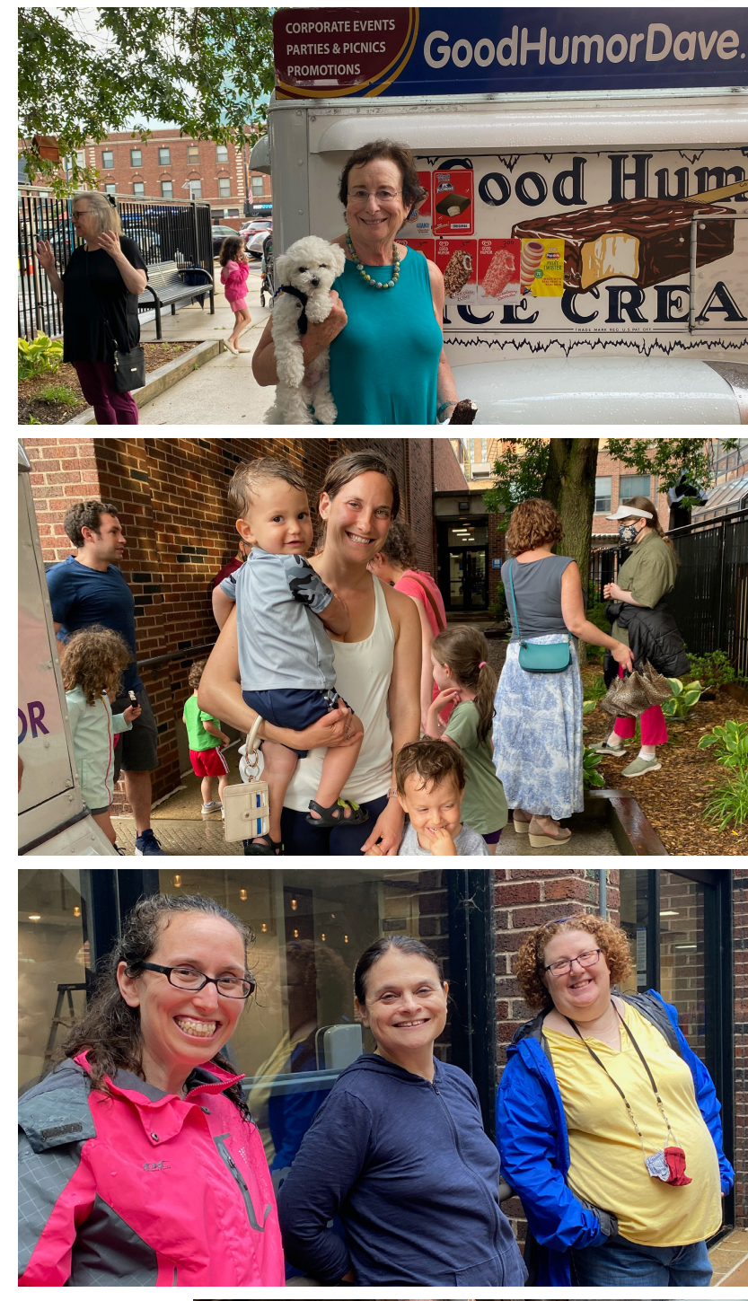
Photos from our June 30<sup>th</sup> Ice Cream with the Anshe Emet Team event, where we enjoyed delicious Good Humor ice cream and seeing familiar faces, in person!